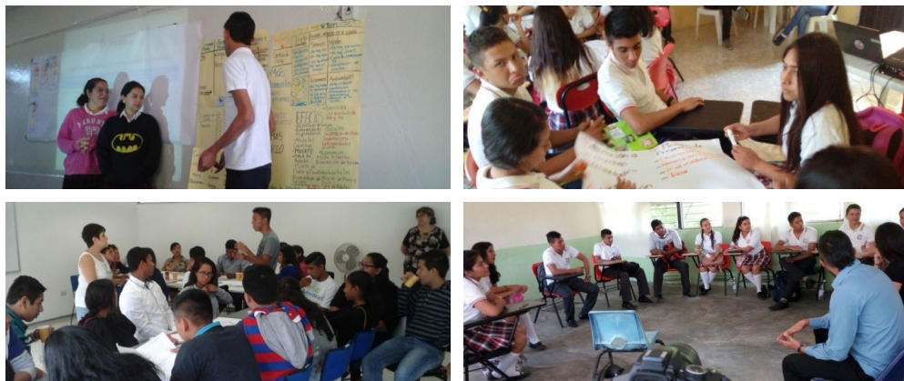
Figure 1. Participation of high school learners in workshops

All the effects [of climate change] are linked; for example, the economic affects the social, because, for the same thing, some people lose their jobs, and, without jobs there is no sustainability in the family, which causes extreme poverty.