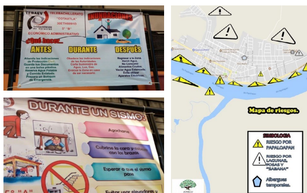
Figure 2. Preventive signs and risk maps made by the youngsters at the workshops

When we returned, we started with talks for our classmates who had finished the sixth semester. It was only them at the beginning. After, we organised ourselves, some others had holidays and so. And then, we returned and everyone in the school knew we had been. We talked about the workshop, how they treated us and all that... and later there was the workshop for all the school. We gave them the talk and asked them to do activities ... We talked to them about how climate change affected the actions we can do to reduce pollution, how we can act in the face of a flood ... Besides, we placed signs in that building about the measures of earthquakes or floods ... We also explained the importance of the risk map, the evacuation routes, how far the river goes, in case it overflows and, well, they participated ... we divided them into teams and each team made their risk map. (High school learners from Cotaxtla)